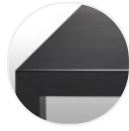
Goffered matt painted black iron X130