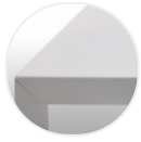
Goffered matt painted white X124