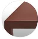
Goffered matt painted corten X128